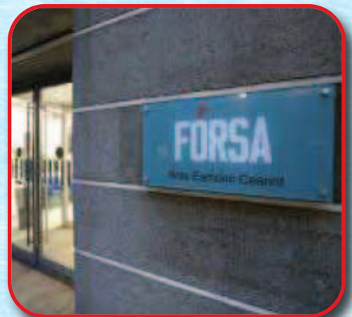
Fórsa, Head Office, Nerney's Court