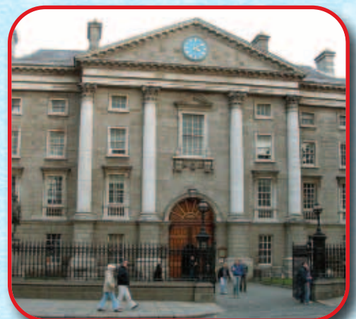
Trinity College, College Green