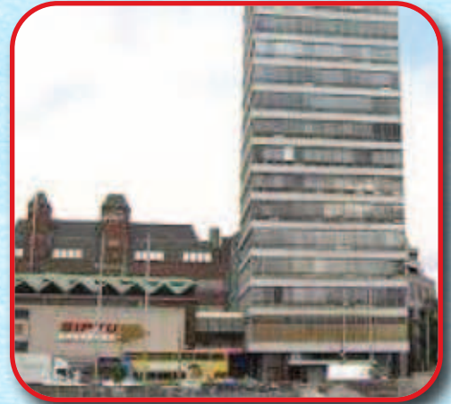
Liberty Hall, Eden Quay